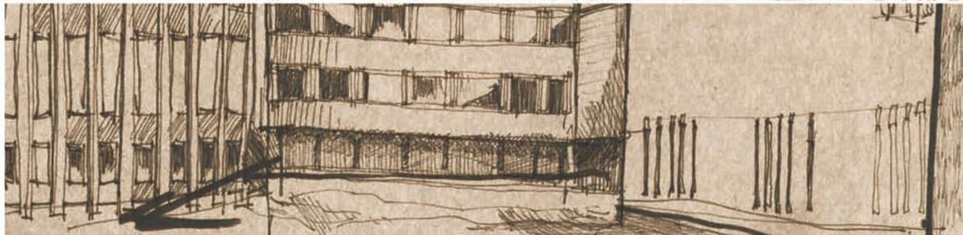
The Peace Garden at St. Peter's Chaplaincy