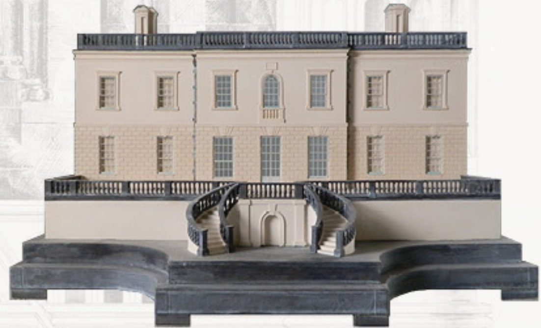
(Model by Timothy Richards)

We wish to examine great examples of lost, demolished and unbuilt architecture through the process of model making. Students will research, interpret architectural drawings, and experiment with materials and ideas in modelmaking.